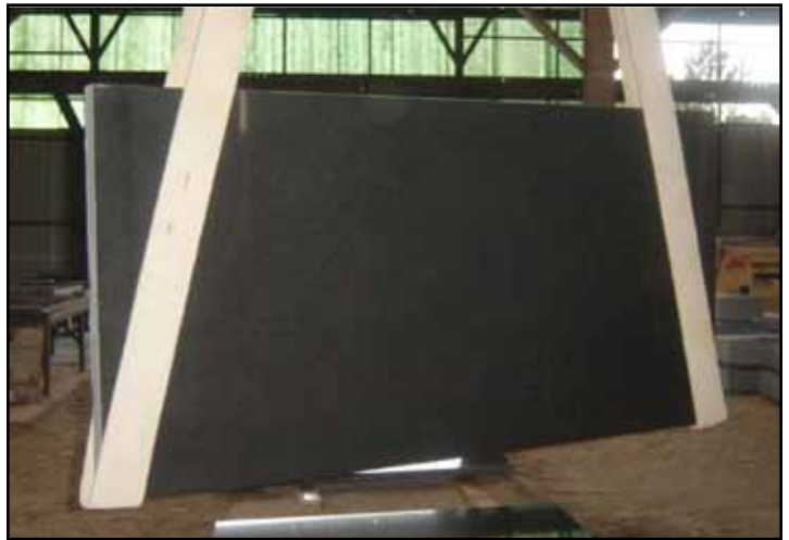
Moving A Panel