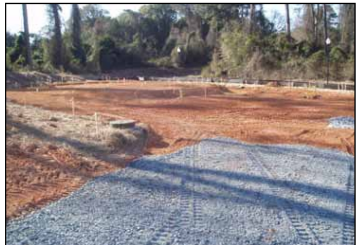
Step #1, Site Preparation by Georgia Development Partners